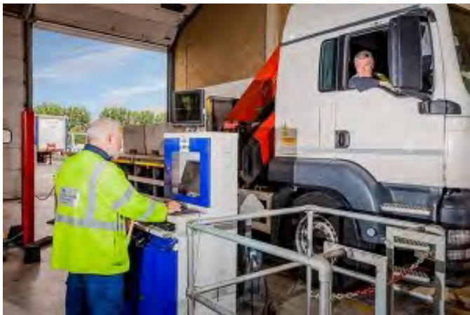
Currently, only DVSA examiners can carry out annual roadworthiness tests on heavy vehicles

Of particular interest to the freight sector are the suggestion that the off-road component of LGV driving tests could be examined by third parties rather than DVSA examiners, and the possibility that employees of private companies will be allowed to perform annual roadworthiness tests on heavy vehicles - including, potentially, their own.